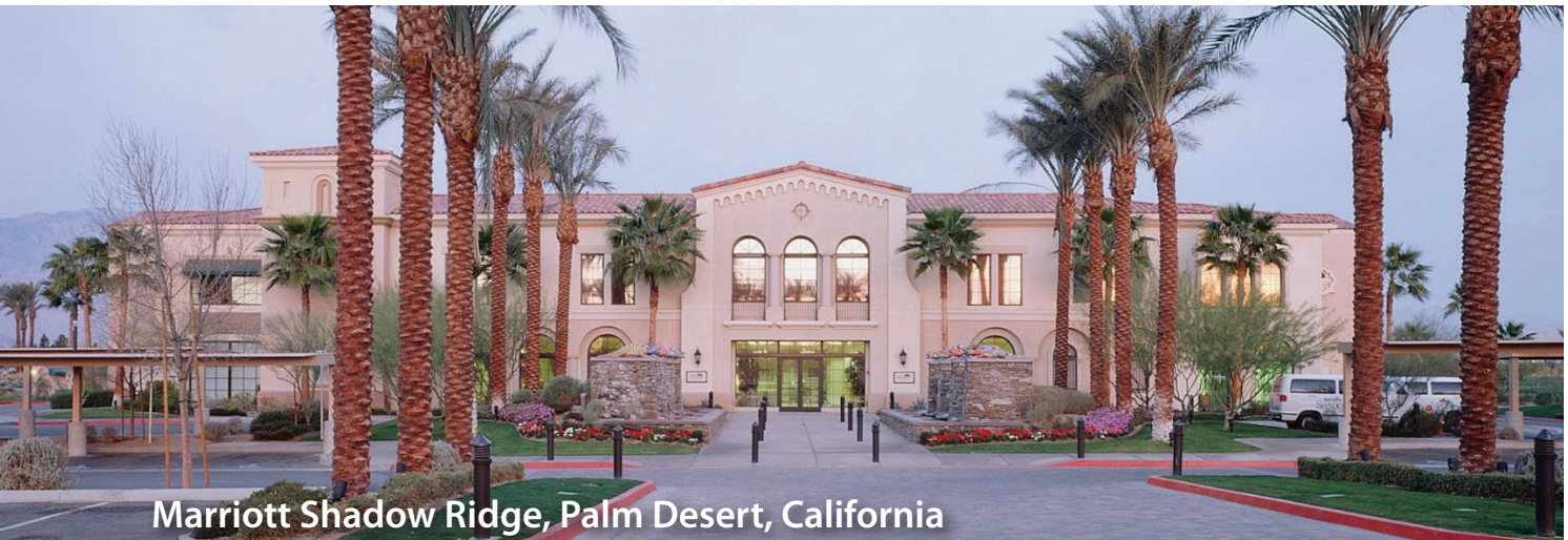
Marriott Shadow Ridge, Palm Desert, California