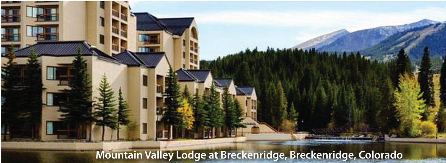
Mountain Valley Lodge at Breckenridge, Breckenridge, Colorado